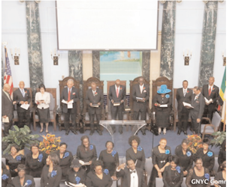
Part of the mass choir on Sabbath.

Other than the Sabbath, we as Adventists have largely forgotten the significance of these feasts, relegating them to the ceremonial system, with the unfortunate result that for successive generations we have, by and large, forgotten or taken for granted God's blessings of the past, and to a large extent lost our focus on our future