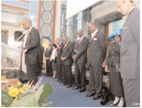
Sabbath Church service, November 17

in the life of this church, and His presence in our 40th Anniversary celebration, we are encouraged to serve Him with all of our being. This anniversary weekend has done something wonderful for us as a church community. It has energized us to serve with greater zeal. Through the messages presented, we have sensed the urgency to give of our best so that by God's enabling grace we will be a part of that grand and glorious celebration in Heaven. We should long for that time to come and, like the apostle John, I say, "Even so, come, Lord Jesus!" Rev. 22: 20.