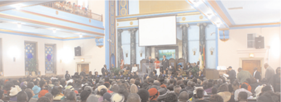
Sabbath, November 17 at Grand Concourse

My Dear Brothers & Sisters in Christ, How quickly 2012 has passed. It seems that only a few weeks ago I greeted you in our winter edition and already the year is over. What a year it has been, however!